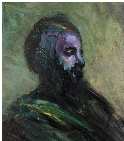
Les intemporels I à IV, 2024 oil on canvas 21 x 29 cm

It's the story we tell in this book, in an attempt to bring together the keys that enable the unconscious of the artist and his viewers to find an easier way to meet.